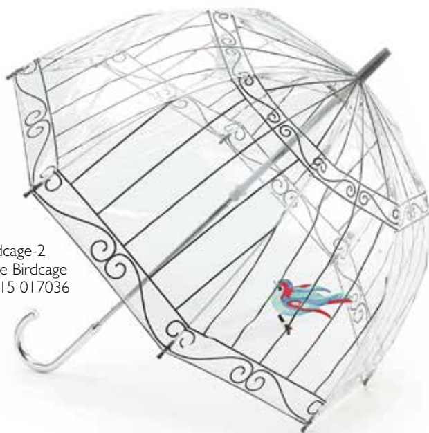
L719 LG Birdcage-2 Birdcage Birdcage 50 20815 017036