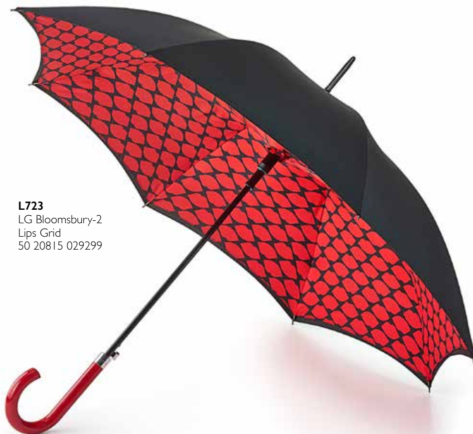
L723 LG Bloomsbury-2 Lips Grid 50 20815 029299