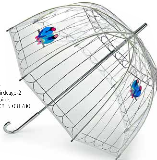
L719 LG Birdcage-2 Lovebirds 50 20815 031780