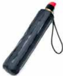
L718 LG Superslim-2 Lipstick Handle 50 20815 031810