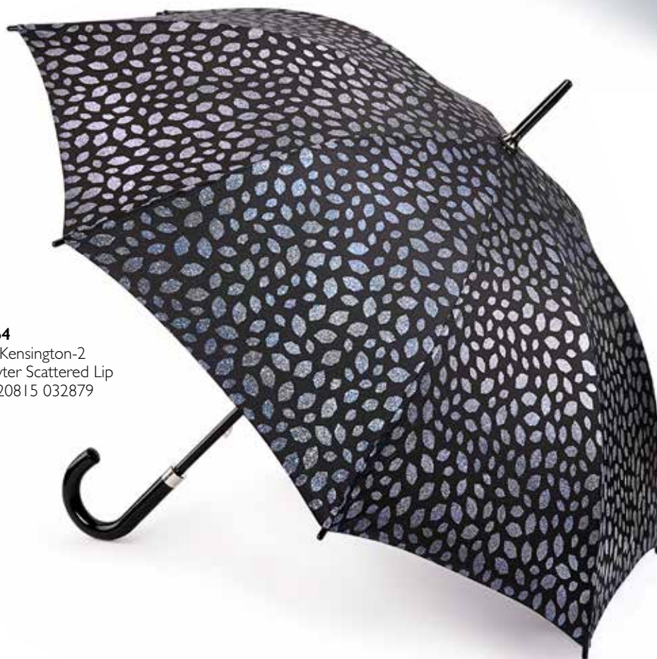
L764 LG Kensington-2 Pewter Scattered Lip 50 20815 032879