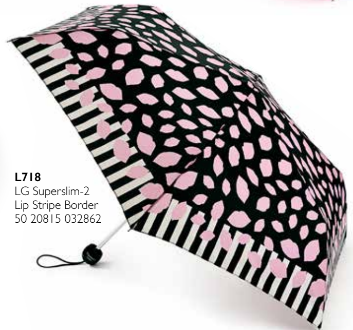
L718 LG Superslim-2 Lip Stripe Border 50 20815 032862