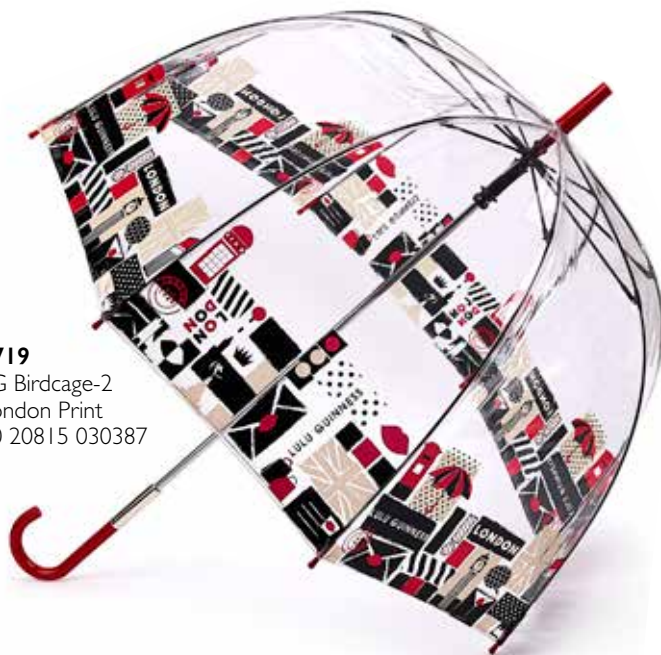
L719 LG Birdcage-2 London Print 50 20815 030387