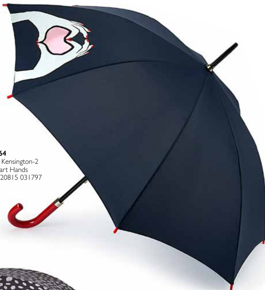
L764 LG Kensington-2 Heart Hands 50 20815 031797