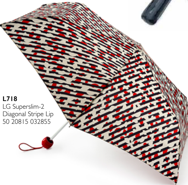
L718 LG Superslim-2 Diagonal Stripe Lip 50 20815 032855