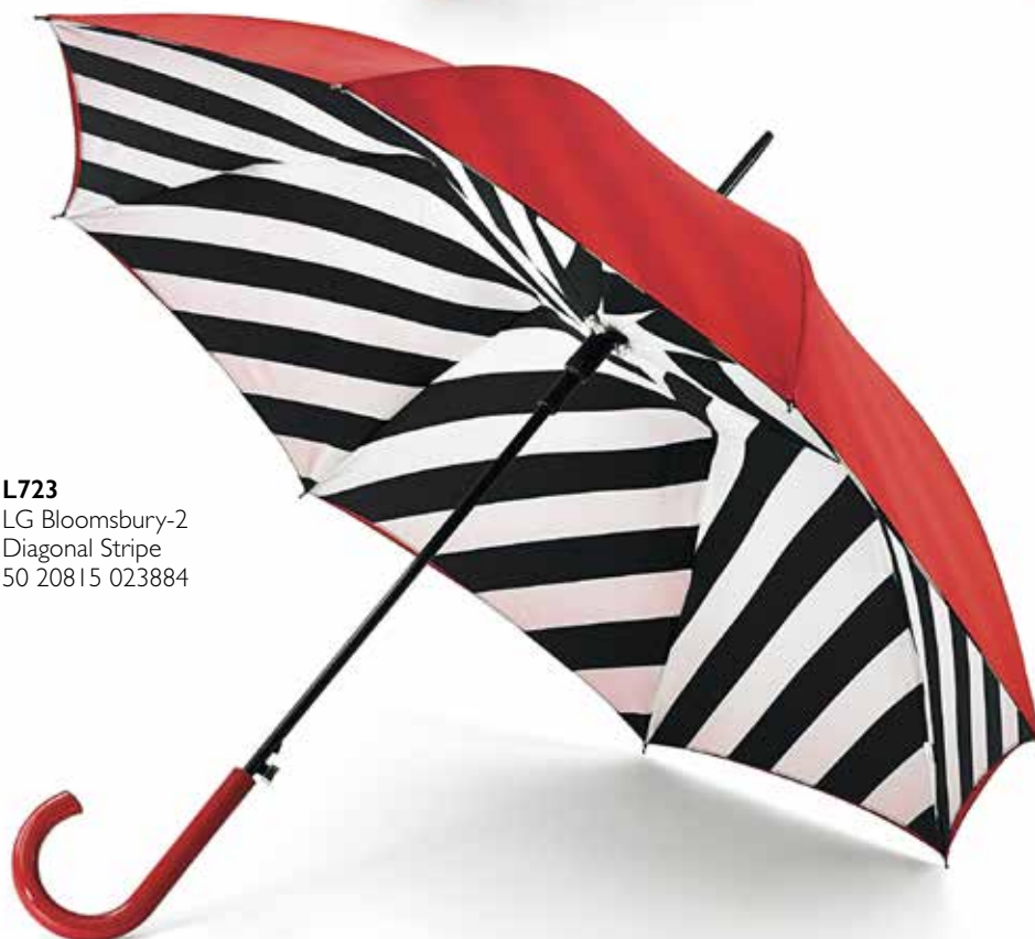
L723 LG Bloomsbury-2 Diagonal Stripe 50 20815 023884