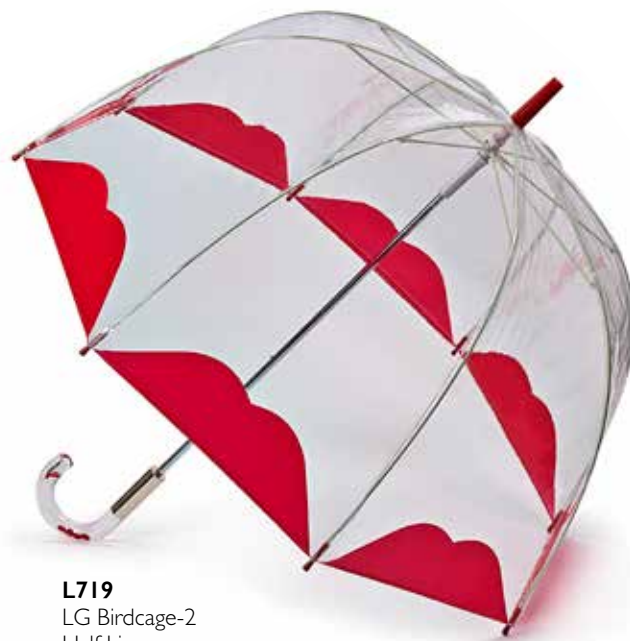
L719 LG Birdcage-2 Half Lip 50 20815 032886