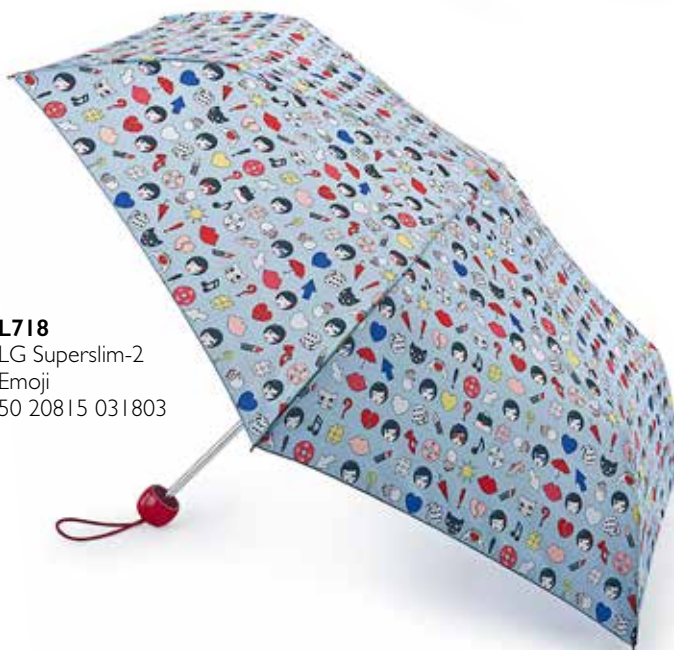
L718 LG Superslim-2 Emoji 50 20815 031803