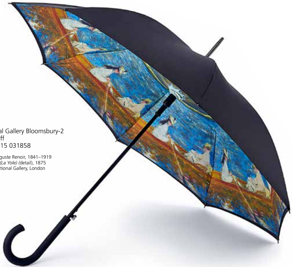
L847 National Gallery Bloomsbury-2 The Skiff 50 20815 031858

Pierre-Auguste Renoir, 1841–1919 The Skiff (La Yole) (detail), 1875 © The National Gallery, London